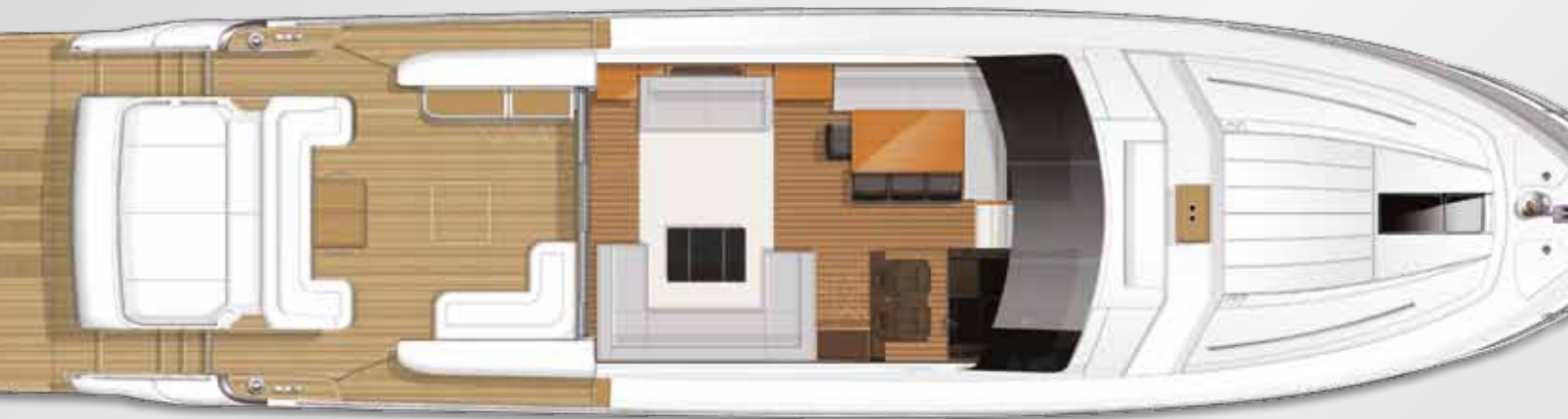
MAIN DECK LAYOUT