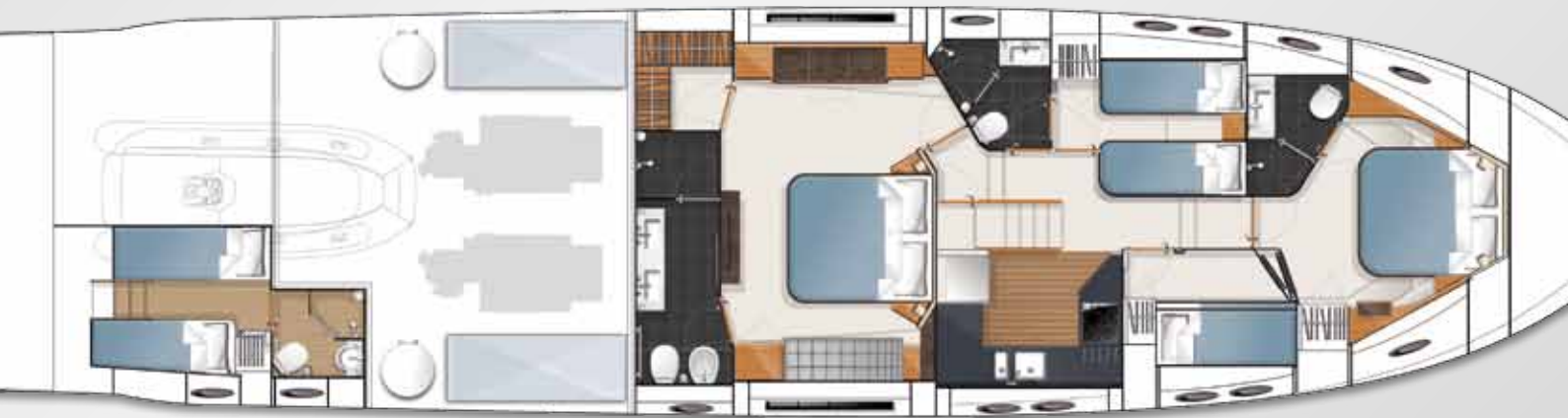
LOWER ACCOMMODATION LAYOUT